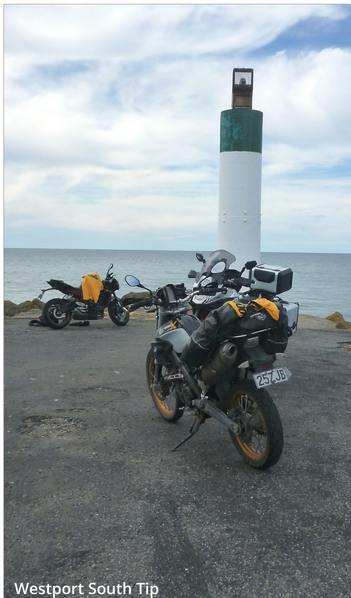
Westport South Tip

to ride 2000 km and collect 2000 points from several photo locations around the South Island.