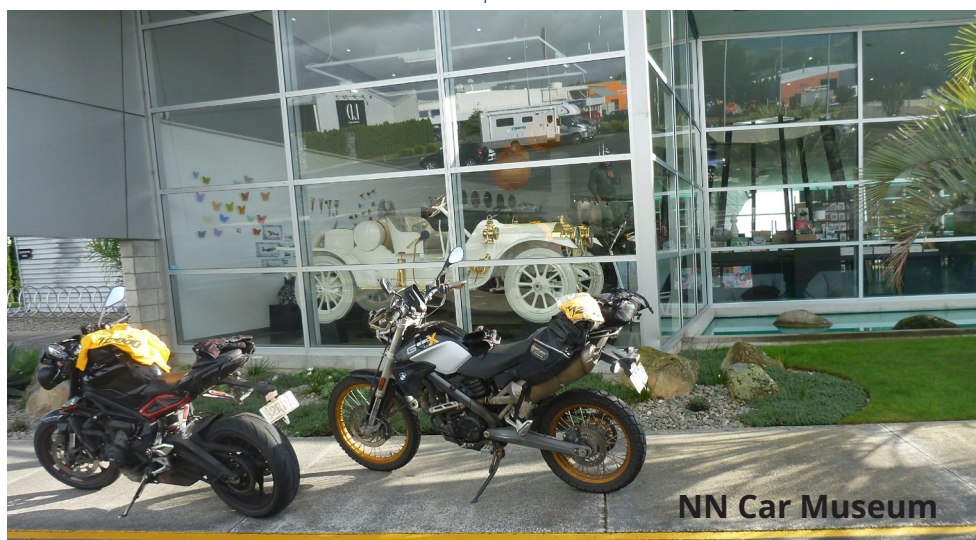
NN Car Museum