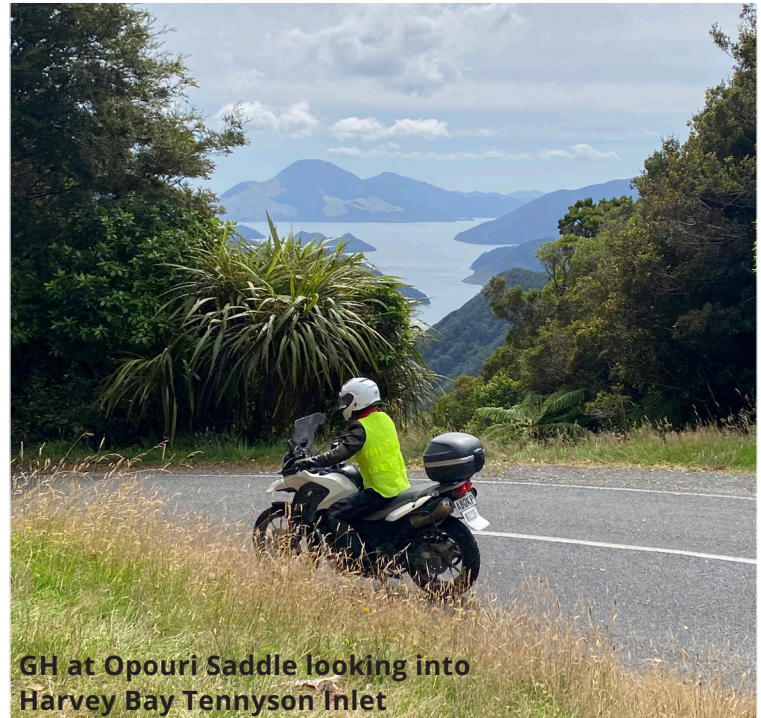
GH at Opouri Saddle looking into Harvey Bay Tennyson Inlet

On our departure, the subject of getting an Ice Cream on our return at Pelorus Bridge was mentioned. Those of us with a sweet tooth thought it was a good idea so a few of us meet up at the Café before returning home.