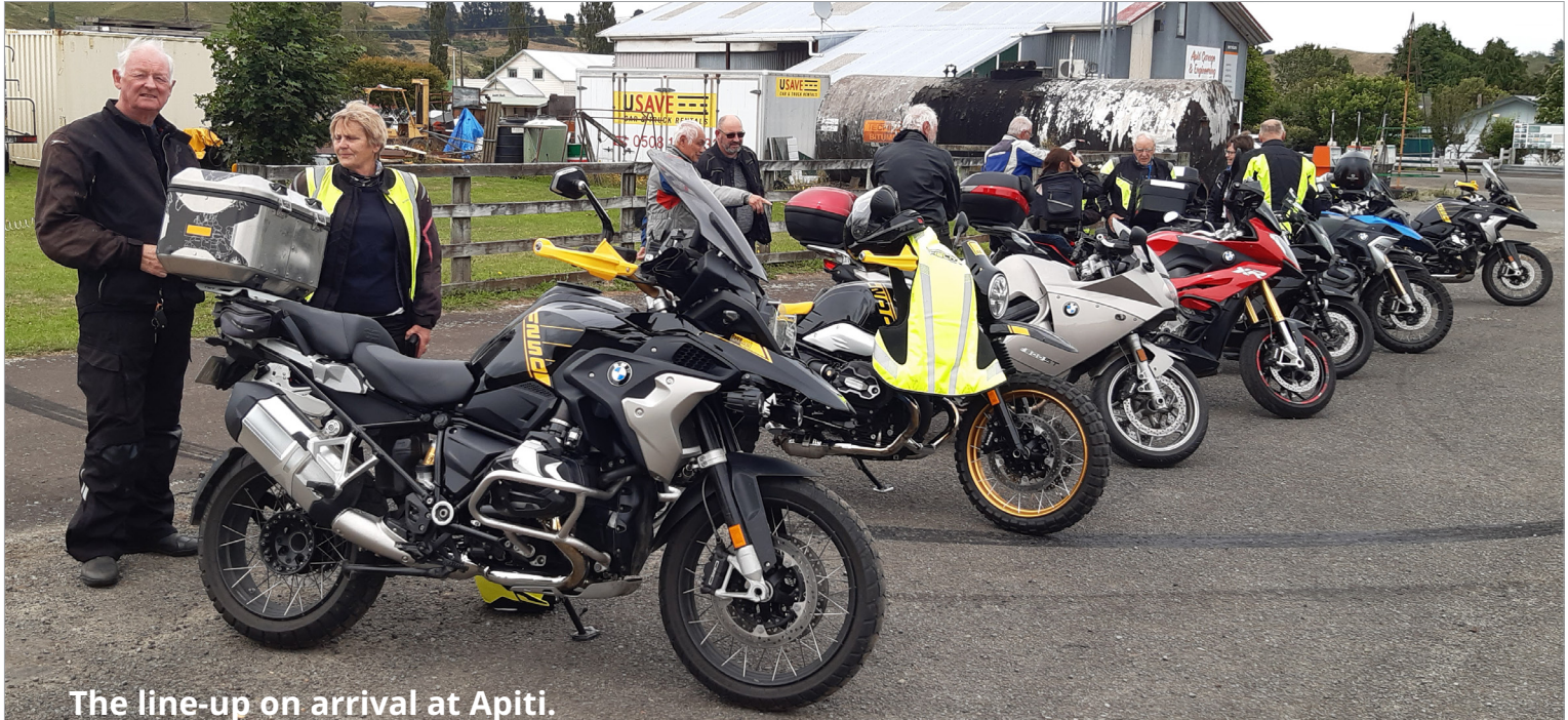
The line-up on arrival at Apiti.