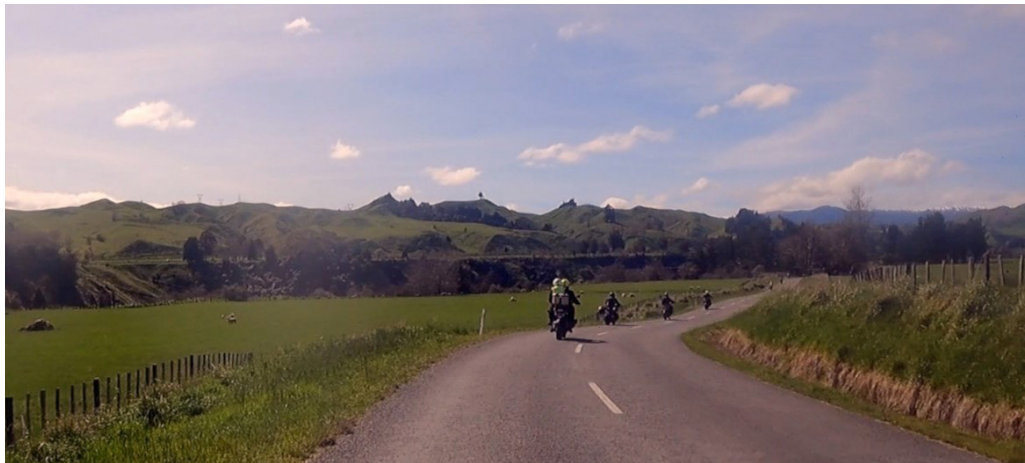
Toetoe Rd.

slip debris by local resident's vehicles. Denis revealed a secret from his past when he noted that he used to drive a school bus in that area (in the olden days) when the roads were still gravelled!