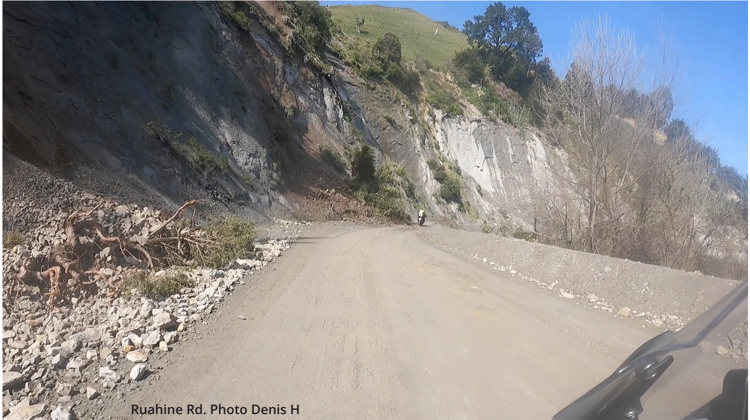
Ruahine Rd.