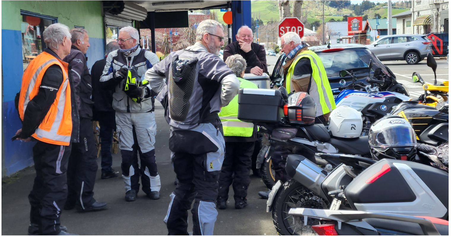
Lunch stop, Brown Sugar Café, Taihape

SANSON, KAUWHATAU VALLEY, TAIHAPE, FIELD TRACK, TURAKINA VALLEY, MARTON AND HOME