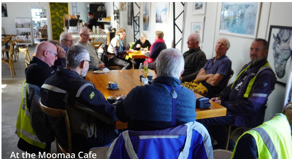
At the Moomaa Cafe