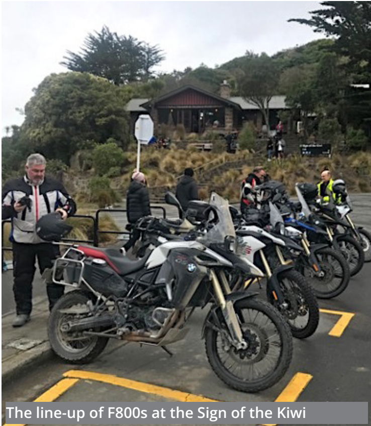
The line-up of F800s at the Sign of the Kiwi