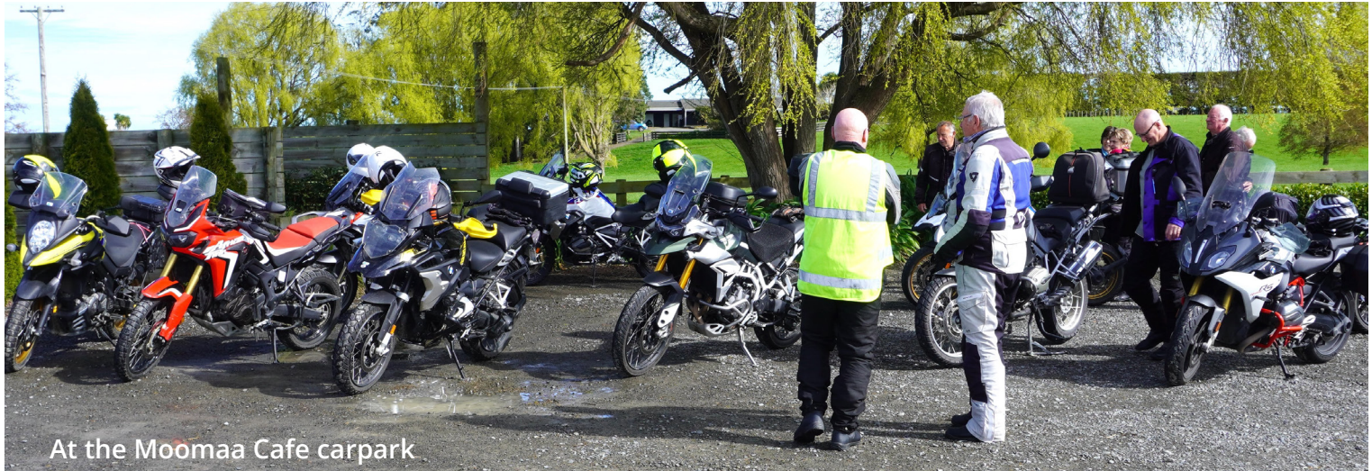
At the Moomaa Cafe carpark

Having in mind that the August ride turned out to be a fairly long haul (at least for some of the participants), I decided to select a rather more modest route for the September ride. Although some of the team experienced showers prior to their respective morning departures the weather for the trip turned out to be a bit better than expected, free of precipitation, so that simply added to the enjoyment of the ride.