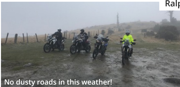
No dusty roads in this weather!