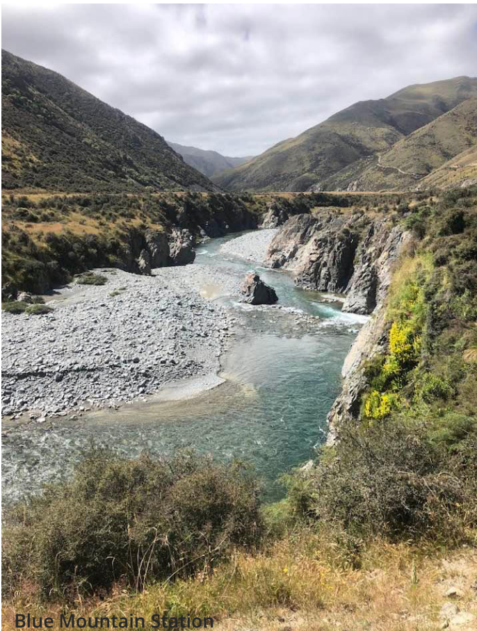
Blue Mountain Station