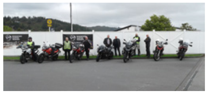
October 2019 Monthly Ride

October Club Ride - While waiting for the riders to assemble at the Caltex Rimutaka 2 bikes came in with each rider checking their tyres pressures. Nothing particularly interesting about this except both bikes were electric