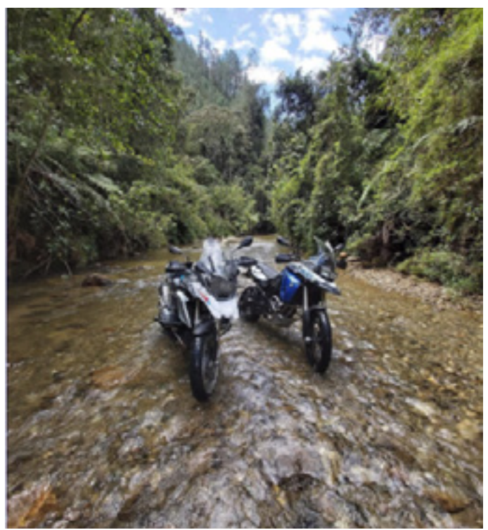
In search of an adventure in the landscape of Colombia

In a blink of an eye many things happened. AL hit the air brakes and with Mr B trains wheels showering shingle and smoke, AL wrenched Mr B train closer to the cliff face to give Jimmy the Jeep space to cut in .