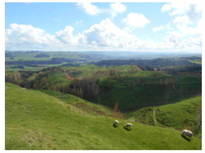
View from Stormy Point