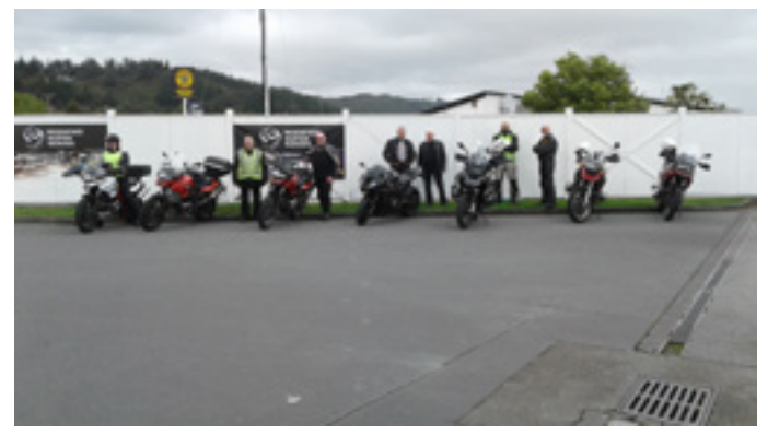
October 2019 Monthly Ride

October Club Ride –While waiting for the riders to assemble at the Caltex Rimutaka 2 bikes came in with each rider checking their tyres pressures. Nothing particularly interesting about this except both bikes were electric