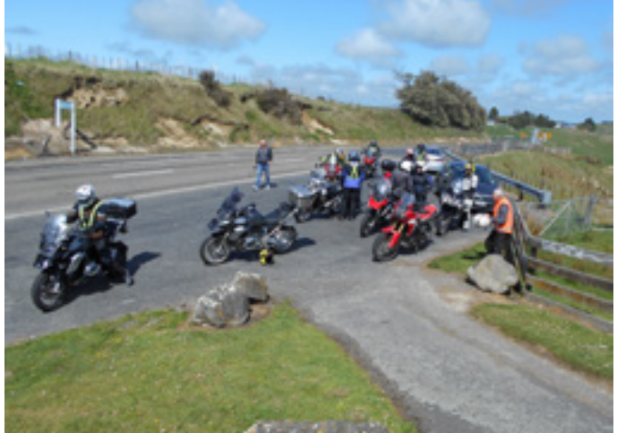
Stop at Stormy Point