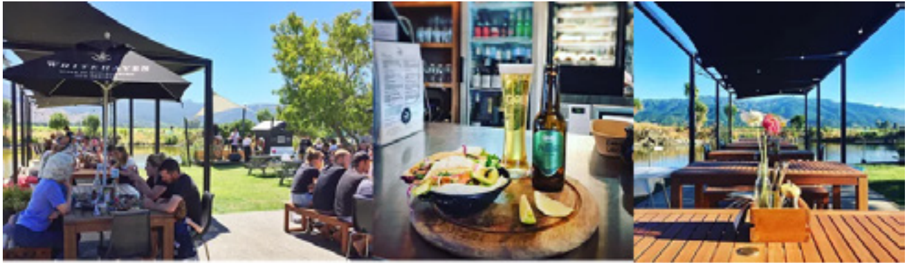
Vines Village Cafe

Friday 24 th to Monday 27 th January | Hosted by Nelson Area BMWOR