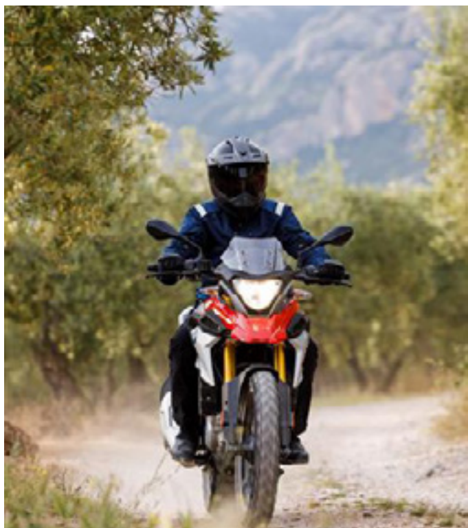
2017 BMW G 310 GS

We then went and checked out the Vines Village nearby, and we were greeted by very friendly staff. The Manager was very helpful and gave us a tour around the facility to show us what was available. There is a brewery, cellar door, cafe, ice cream parlour and a lovely garden by a large pond. They also brew their own Kombucha and the Manager kindly gave us a tasting, absolutely delicious, I will definitely be having some of this when I go back. Time was getting on by now so we decided to call it a day, headed home and made it back before dark.