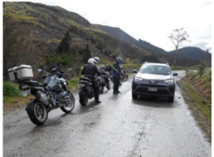
Chatting with some friendly locals at the start of our first gravel section.

The rain had stayed away but we now struck winds strong enough to really sharpen your focus onto holding your line. The road climbs up to around 700m and at the top where it goes through a cutting it was really whistling. Down from