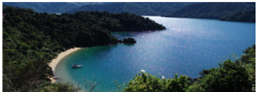
View from Port Underwood Road

Suitable for all levels of gravel rider. You will need to bring along a picnic lunch. In Blenheim town centre there are plenty of cafes, a Subway and a supermarket to get suitable food and drinks to take along for the ride.