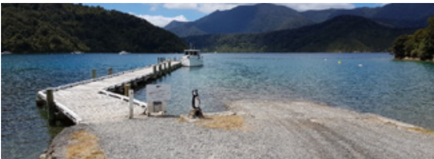
Jetty at Penzance

The Nelson Region BMWOR look forward to welcoming you in January 2020.