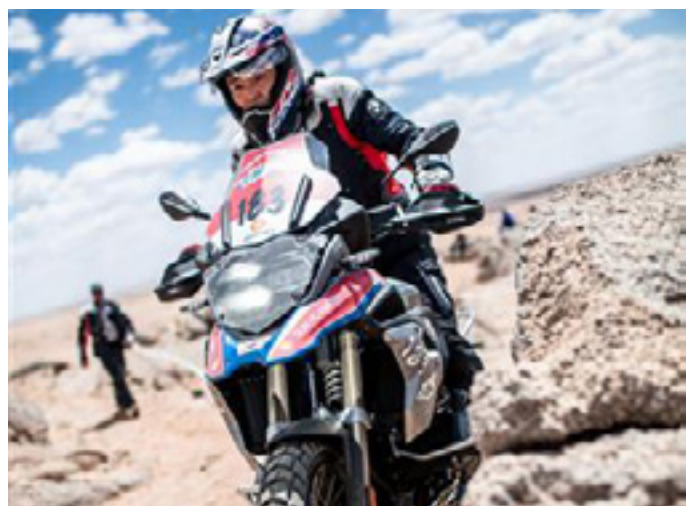
BMW Motorrad Int. GS Trophy Central Asia 2018