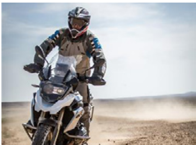
BMW Motorrad Int. GS Trophy Central Asia 2018 - facebook